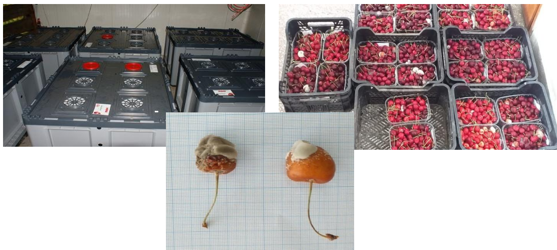
Fig. 3. The fruits affected by fungi - storage in Janny MT boxes